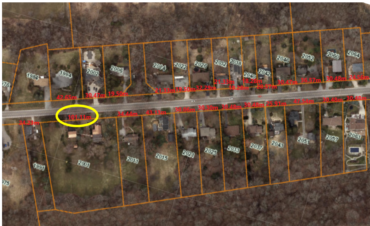
Figure 7 - Existing Lot Pattern

As shown in Table 1 and Figure 7 , the proposal would break up an uncharacteristically large lot into three lots that are consistent in lot area and have consistent lot frontages with the adjacent and surrounding residential lots. On average, lots within the surrounding area have approximately 30m of frontage and are approximately 2,500m 2 (0.61 acres) in area. The subject property is considerably larger than the average property at 12,409.72m 2 (3.06 acres) in area with 101.11m (196.85 ft.) of frontage. The proposed lots are to be between 2,716.66m 2 and 2,910.59m 2 (0.67-0.72 acres) in area, each with 32.23m (105.74 ft.) of frontage, and more closely reflect the existing lot pattern along York Road.